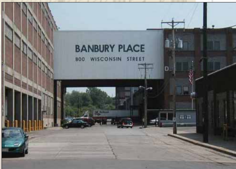
TSSI's Eau Claire Office is Located in Banbury Place, a former tire factory.