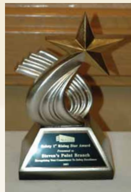
Safety 1 st Rising Star award

Congratulations to all the award recipients for 2007! You make the difference for Marsden's customers and your fellow employees.