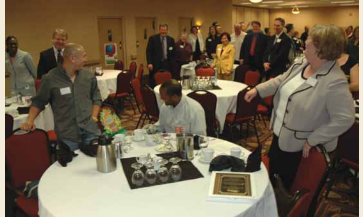
Awards Banquet was held at the Radisson Hotel Roseville.